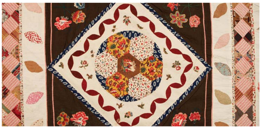
Top, 20th century Afghan patchwork tent hanging ('yuruk yastik') made with 'abr' or 'ikat' silk, cotton and embroidery scraps, and finished with narrow panels of cross stitch.